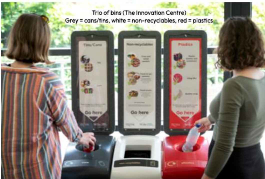
Trio of bins (The Innovation Centre) Grey = cans/tins, white = non-recyclables, red = plastics