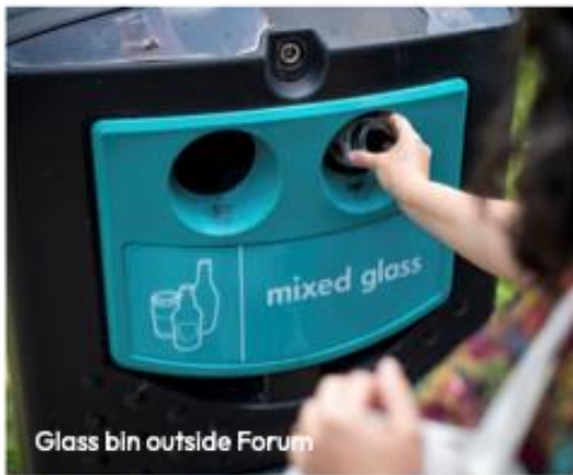
Glass bin outside Forum