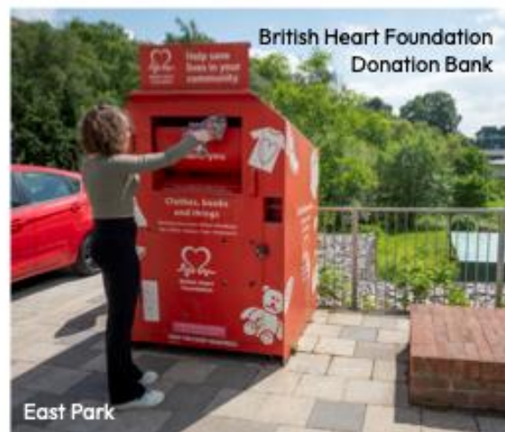
British Heart Foundation Donation Bank