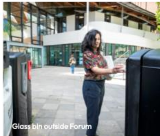
Glass bin outside Forum