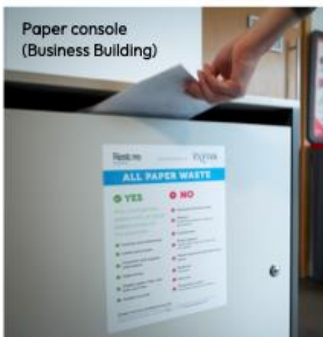
Paper console (Business Building)